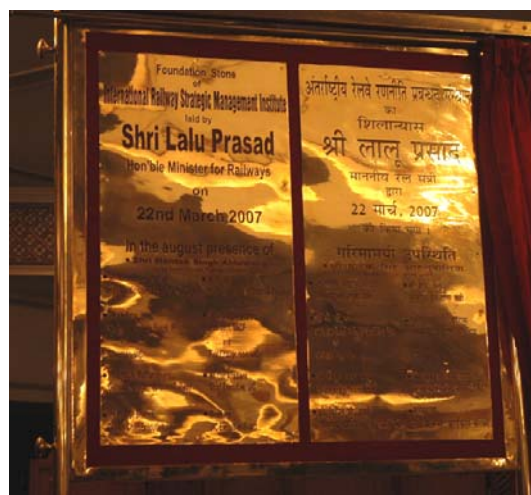
Foundation Stone laying ceremony for the "International Railway Strategic Management Institute" in Delhi on 22 March in presence of Honorable Indian Railways Minister Mr Lalu Prasad.

The future expansion of international rail freight services will require long-term investments in dedicated infrastructure and facilities.