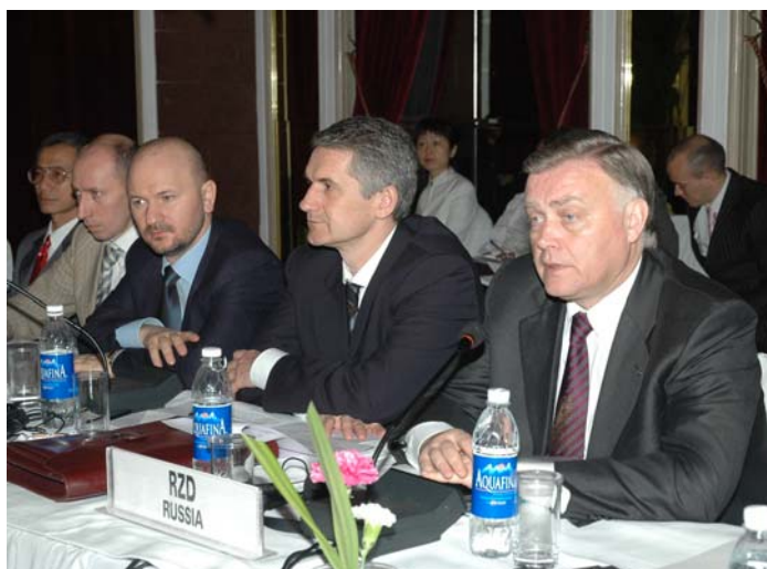
Mr Vladimir Yakunin, President of JSC Russian Railways (on the right), and the RZD delegation.