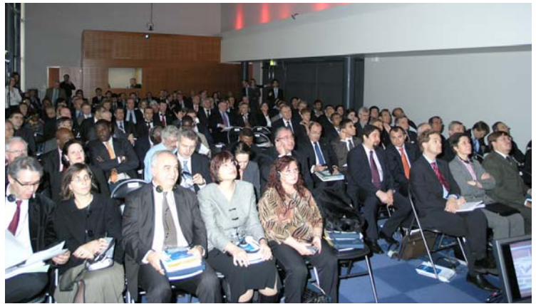
The UIC General Assembly took place at SNCF Headquarters in Paris on 7th December.

As part of UIC's globalisation process launched in 2007, an increasing proportion of international cooperation activities are now dealt with within the UIC's