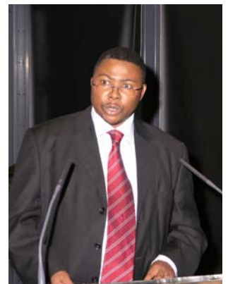
Siyabonga Gama, CEO Transnet (South Africa), Regional Assembly Africa.