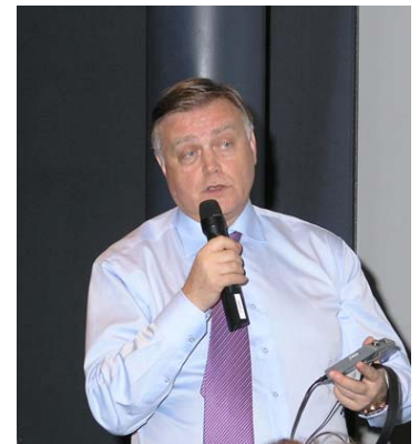
Vladimir Yakunin, President of JSC Russian Railways.

By closing the meeting on behalf of the Host railway, Mrs Anne-Marie Idrac welcomed the global positive evolution in rail transport, in the passenger as well as the freight sectors. Two main trends are in favour of an increased role for rail transport: globalisation of economies and the need for efficient integrated logistic systems on one hand, and the demographic growth and the need for high capacity links between cities on the other hand. The world-wide fight against CO2 emissions and global warming represents another major asset for railways' development today and in the near future.