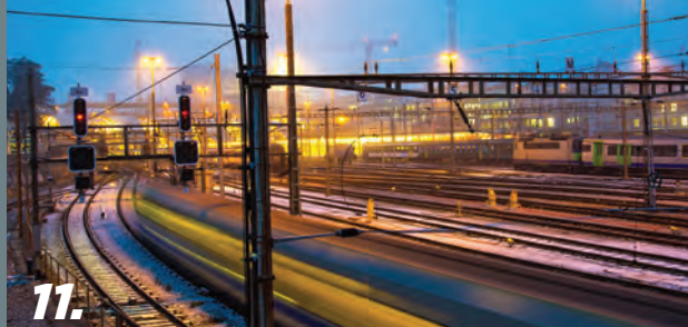
ENERGY SUPPLY AND CONSUMPTION